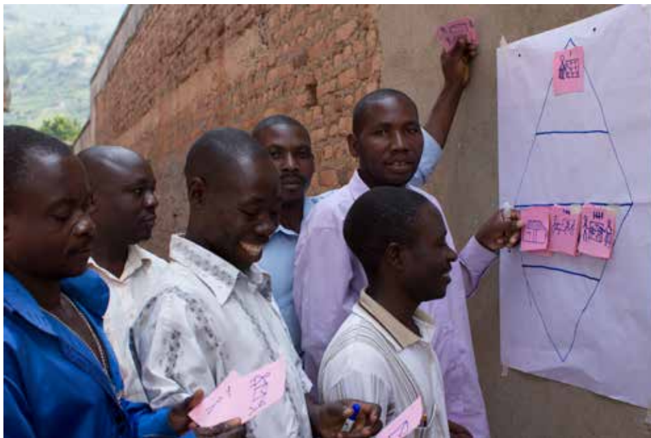
Bottom: Men in Bukonzo Joint doing their Diamond for participation in Decision-making.