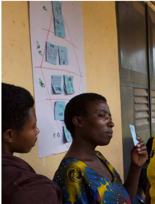
Top: Women in Bukonzo Joint do their Diamond for Decision-making