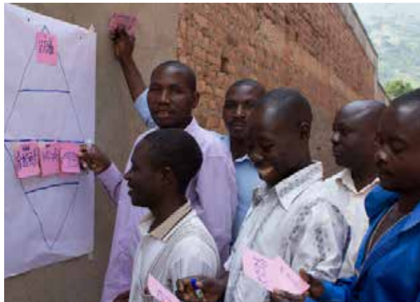
Men in Bukonzo Joint Cooperative, Uganda doing their Diamond for participation in Decision-making.

In a Participatory Gender Review each session may focus on only one right, comparing responses of different groups of women and men, or different groups can take different rights and then people can vote in a plenary.