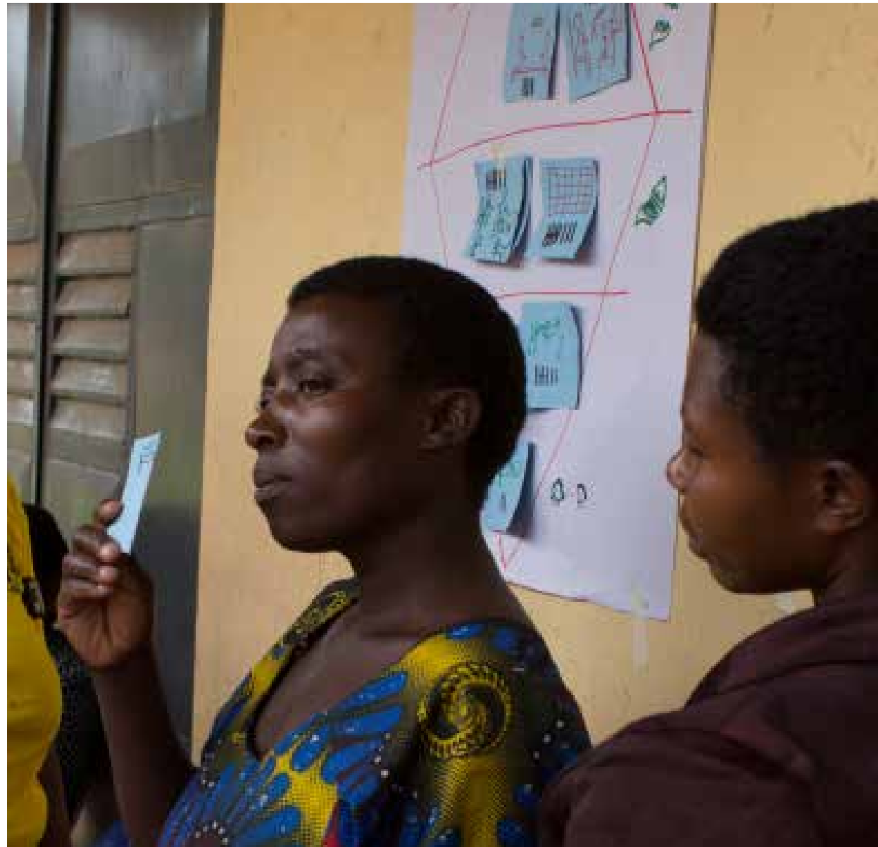
Women in Bukonzo Joint Cooperative, Uganda do their Diamond for Decision-making.